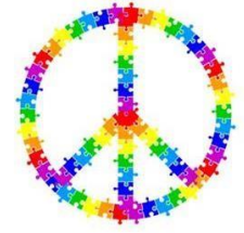
SHALOM Peace, completeness, nothing missing, nothing broken, well- being, wholeness