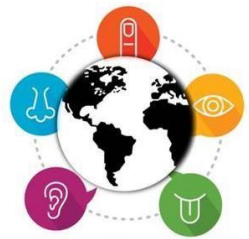
YADA To know; to see; to perceive; to understand; to experience; to have a relationship with