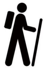
RABBI Teacher, guide, role model

Equipping children with skills and abilities to succeed in all environments; intentionally planned to structure deep learning through the 9 Habits lens.